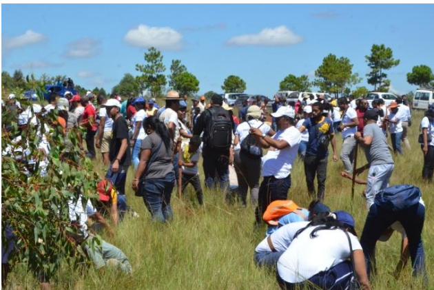
Photo 6 Participants