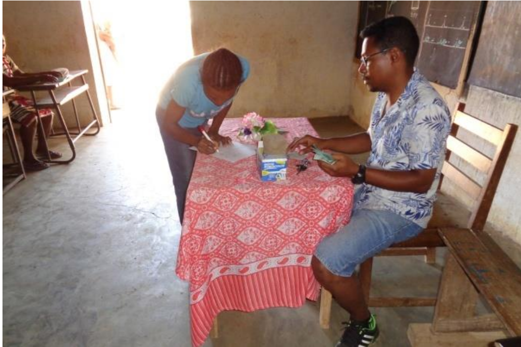
Photo 1 Teacher's payment

The grant continued until the end of the school year. The number of community teachers who benefited from this subsidy is still 78 and they spread over the three communes, including the commune of Maromandia, Befotaka and Ambolobofo.