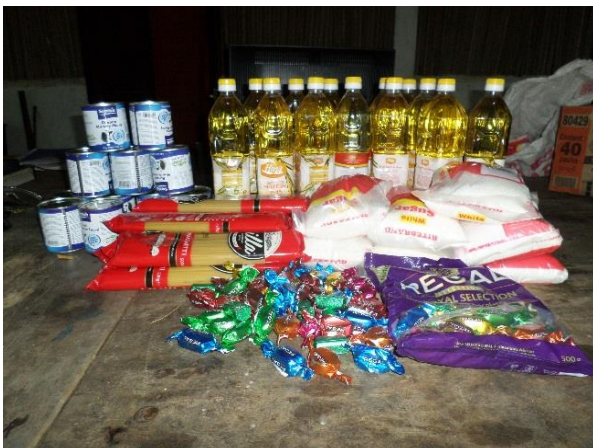
Photo 29 Donation

To mark the end of what has been a difficult year, we gave each of our team a gift basket. Each basket contains 1 liter of oil, 1 kg of sugar, a can of condensed milk, some pastas and some sweets.