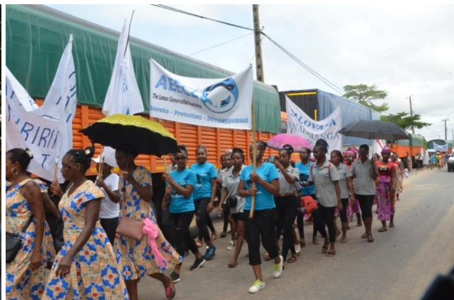
Photo 17 Carnival

In her speech, the women's representative paid tribute to all Malagasy women who, despite the obstacles, had worked hard to make progress on a daily basis. There are still great challenges to be met, including the fight against violence against women in all its forms, respect for the rights of young girls and the improvement of health conditions for mothers and children, she stressed.