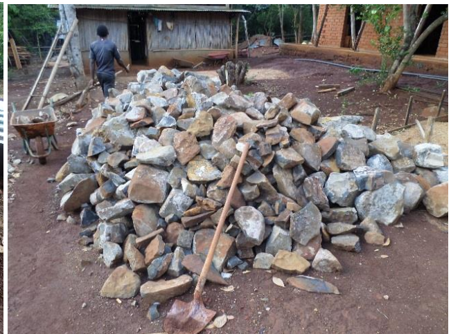
Photo 21 Rocks cleared