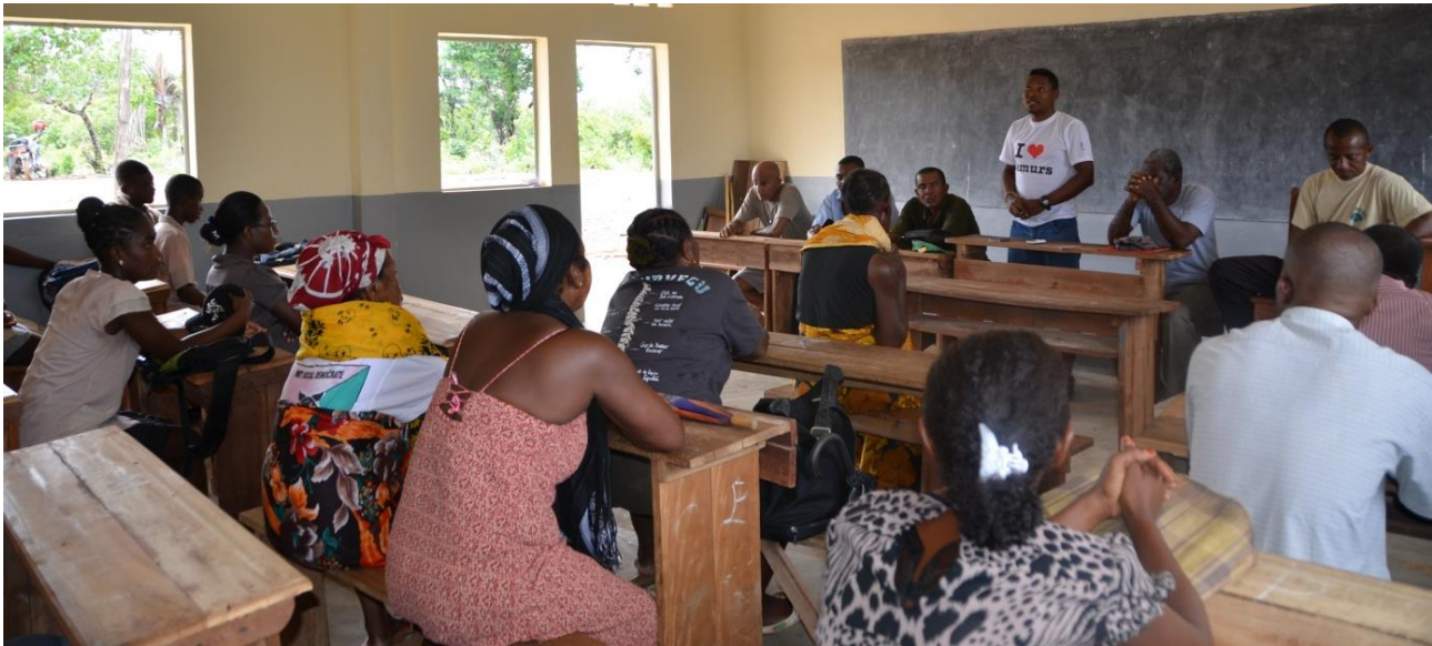
Photo 3 Meeting with community teachers

Before the end of the year 2020, we also met with the teachers and talked about the year 2020. The year 2020 has been a very difficult year, but many students have moved on to their higher degree. However, the government's decision on free enrolment or 0 ariary in all public schools was not well seen by the teachers. In fact, the government took this decision to help parents and will subsidize teachers in compensation. Since the decree was issued, the number of children attending school has increased by 50%. There was even an overcrowding of pupils in some villages. However, no subsidy is received by the teachers. As a result, teachers have to fend for themselves for school supplies such as chalk and notebooks. Many of them are unable to provide these items.