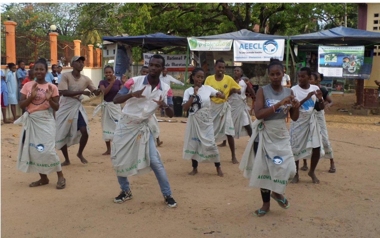
Photo 14 Group performance