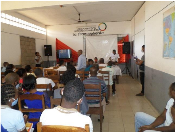
Photo 12 Opening ceremony

There were fewer participants because the festival was organized in a hurry and the time allocated for public awareness was not sufficient.