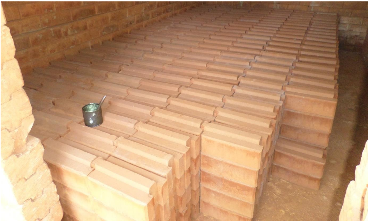
Photo 24 Bricks made by the construction team.