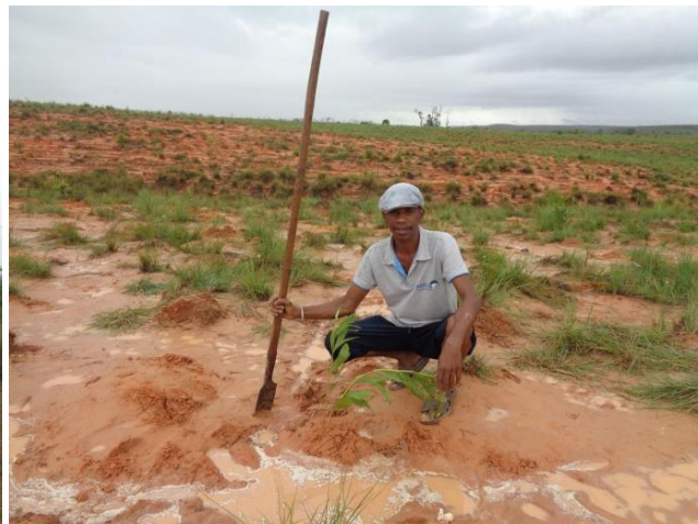
Photo 5 Reforestation