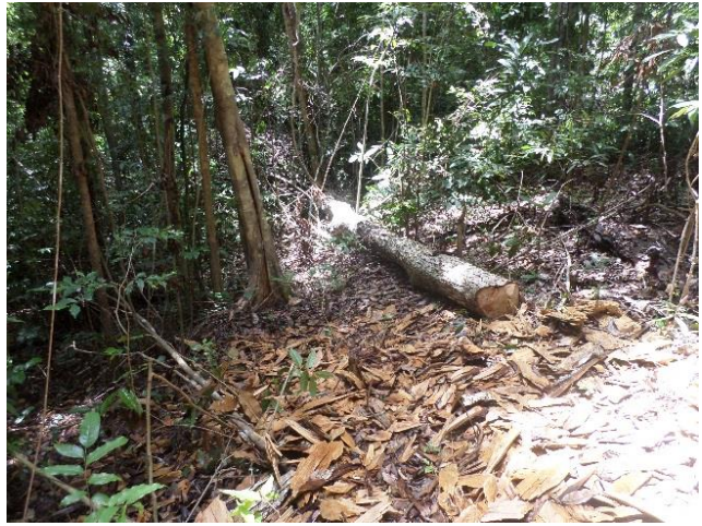
Photo 9 Bridelia pervilleana

As well as these trees they have also cut the Kindro ( Dypsis lutescens ) or palm tree which is an endemic tree species. It seems that they cut this tree to eat the kernel while they are in the forest. It is also likely that these loggers have taken lemurs because our patrollers found traps in the forest. Whenever our patrollers observe the loggers, they try to talk to them but they refuse to talk and play with their axes to intimidate the patrollers. Our patrol team remove the cut trees to camp or destroy them. However one night, the loggers came to the camp and stole the confiscated trees. This is obviously a threatening situation to the team and the loggers have become aggressive.