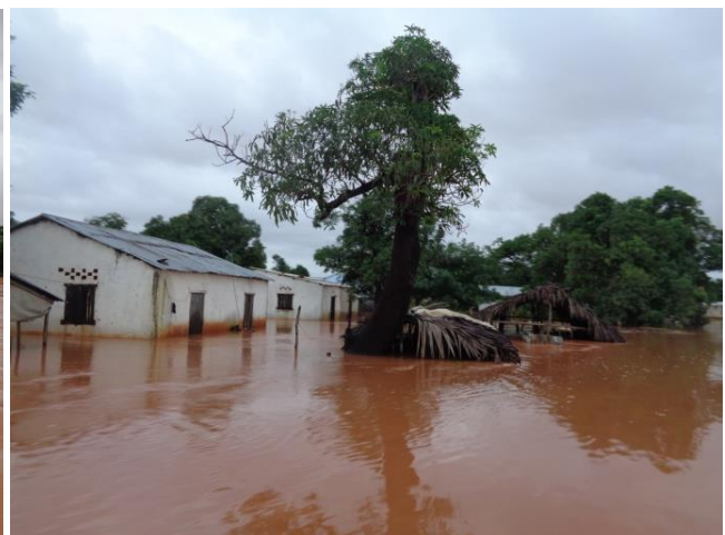
Photo 26 Houses under water