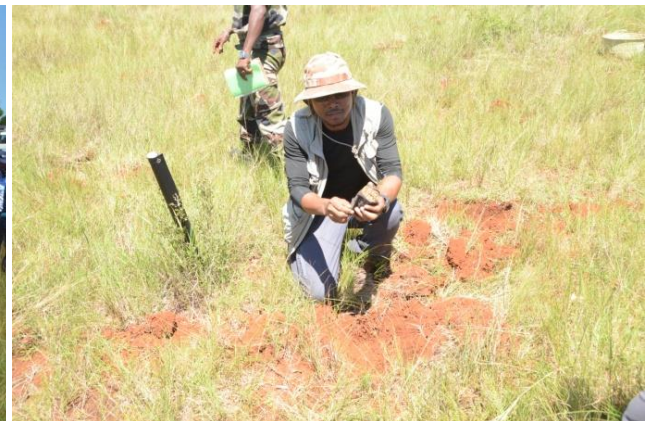
Photo 7 AEECL team