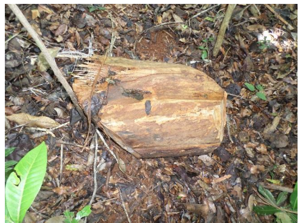
Photo 11 Rest of tree