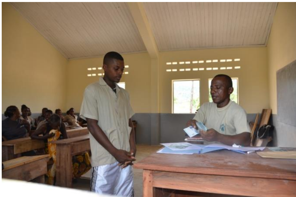
Photo 2 Distribution of scholarship for student