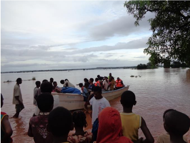
Photo 27 Rescuing villagers

As soon as the water level dropped and people were safe, we took the boat back to Antsohihy.