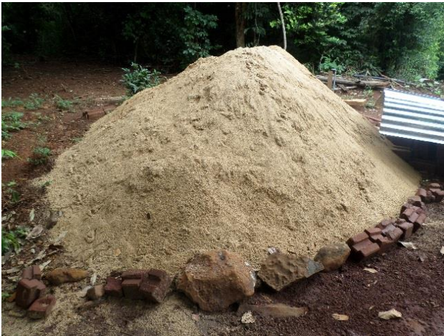
Photo 20 Sand used for building work

The doors and windows for the new building were also being installed.