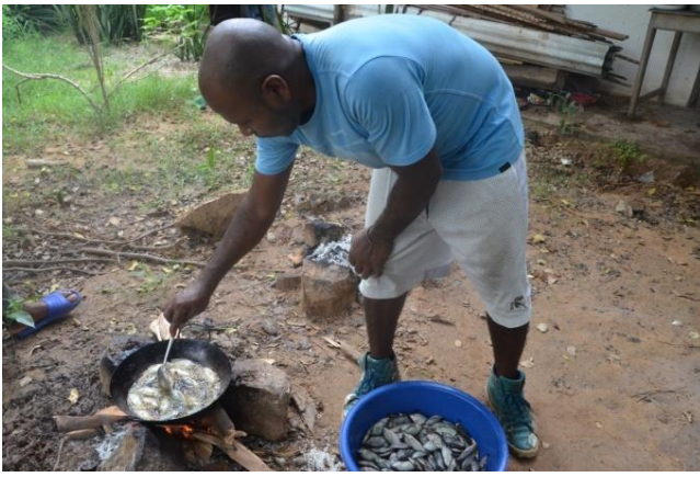
Photo 18 Food preparation