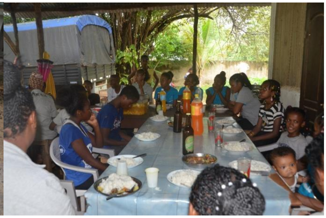
Photo 19 Meal