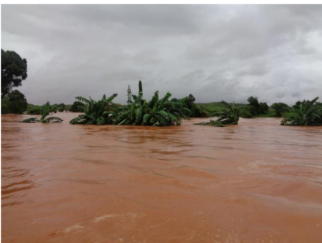
Photo 25 Floods

When we arrived, the village was already submerged in water. People had to climb into trees or onto roofs to stay safe. The water height was estimated to be at 3 m.