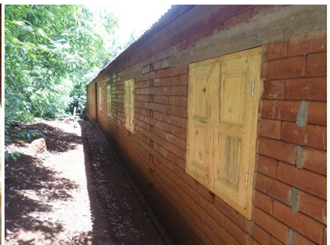
Photo 23 Window shutters on new building