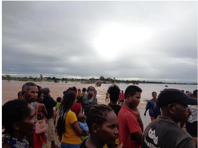
Photo 28 Victims of the floods