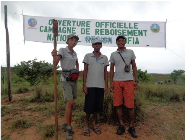
Photo 4 AEECL team