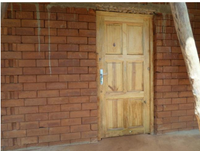
Photo 22 New door on research building