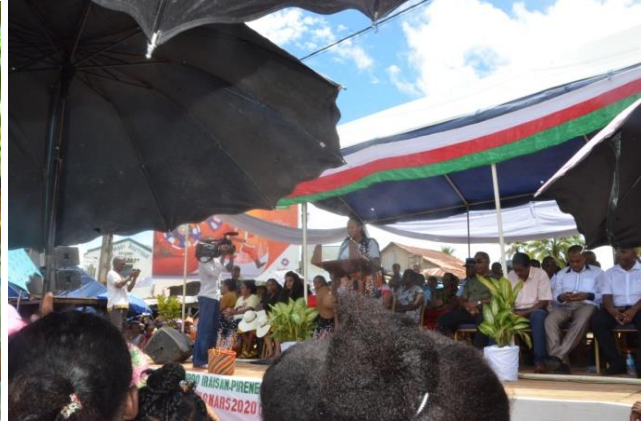
Photo 16 Speech