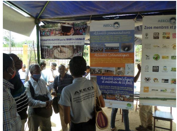
Photo 13 Visit of stand