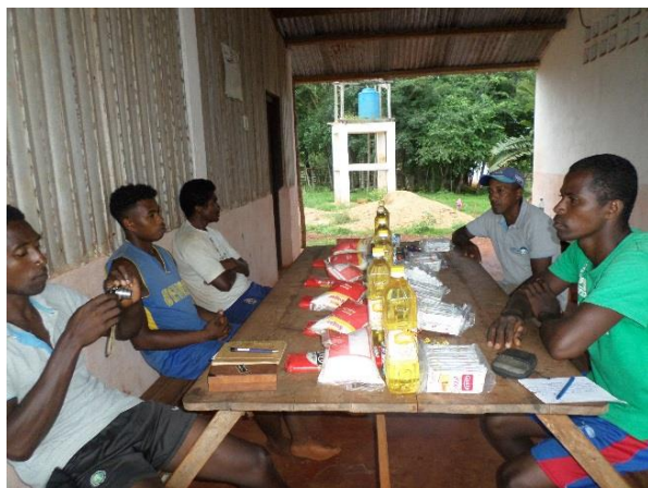
Photo 30 Team in Ankarafa